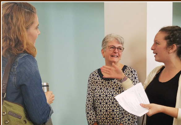
Guests enjoy post-worship fellowship.